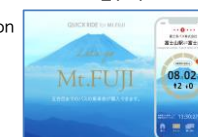
QUICK RIDE for Mt.FUJI